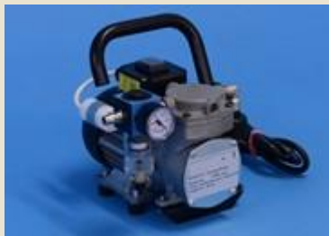
22.029 Vacuum pump.