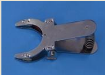
22.320 Snap holder.