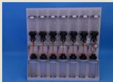
22.300 Vacuum filtration station.