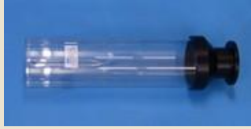
22.305 Filtration bottle: (top).